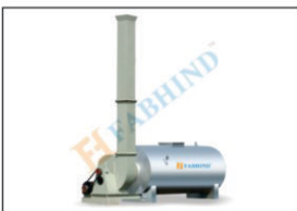
POLLUTION CONTROL UNIT