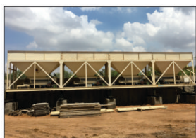
FOUR BIN FEEDER