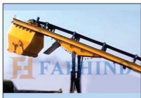
LOAD OUT CONVEYOR