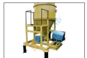
MINERAL FILLING UNIT